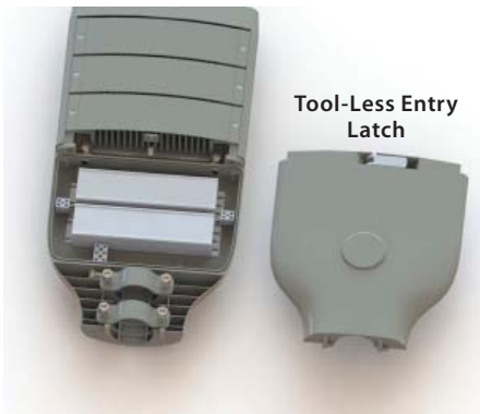
(2) Mounting Clamps (4) Stainless Steel Fastening Bolts

Accepts 1-1/4" - 2-3/4" O.D. Tenon or Pipe