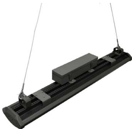
Hanging Mount Gripple Hangers Included